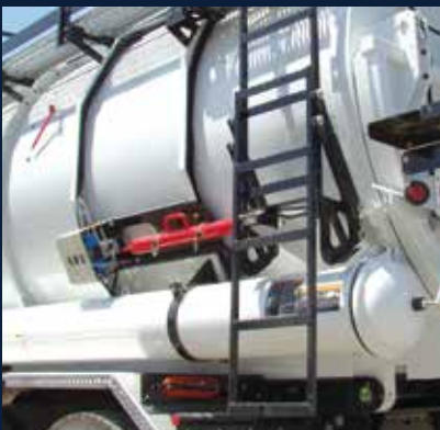
Ground level maintenance