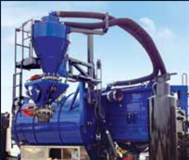
XCR swing-out cyclone

Available in three configurations, this option can be as simple as adding high-rail gear to a standard Guzzler. Or choose a fully equipped high-rail cleaning system that features a loading boom, hydraulic creep drive and rear-mounted operator chair, where complete operation can be achieved from a single position while loading or driving over the rails.