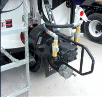
Rear door mounted sludge pump

The Guzzler CL modular design allows you to select an offloading solution for your specific needs, so you get minimal downtime and maximum productivity. Guzzler offers the widest selection of configurations of any manufacturer.