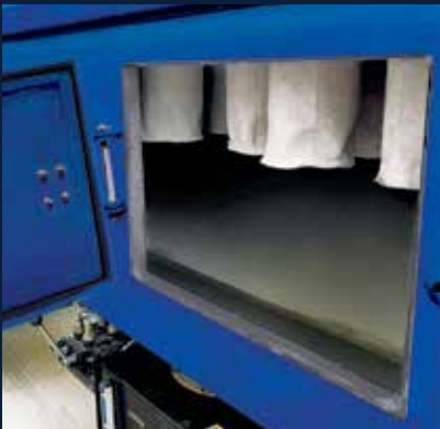
Larger baghouse access doors