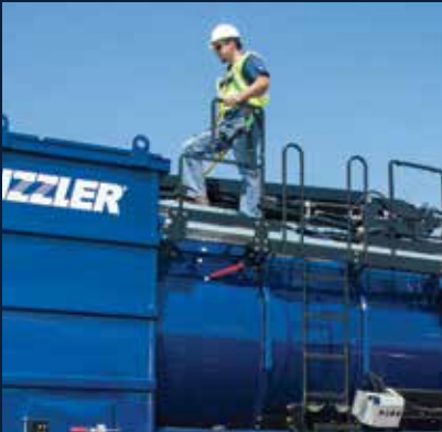
Standard ladder, catwalk, and railing